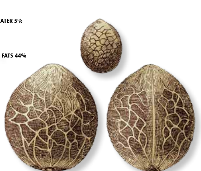
Hemp seeds are as rich in protein as soy, and contain more fats than proteins.